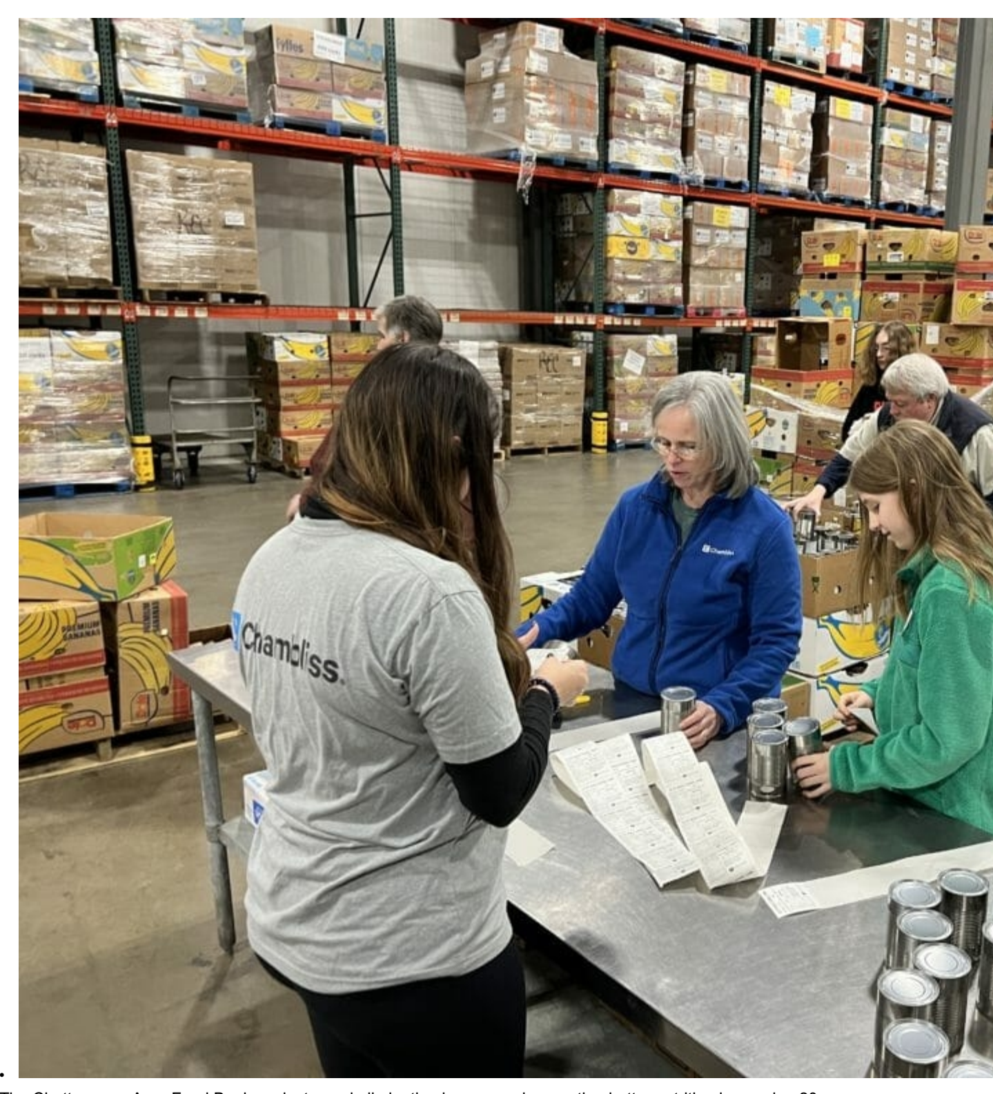
The Chattanooga Area Food Bank works toward eliminating hunger and promoting better nutrition by serving 20 counties in Southeast Tennessee and Northwest Georgia. Working with retailers, manufacturers, farmers, buying alliances, and donors allows the Food Bank to distribute over 17 million pounds of food each year.